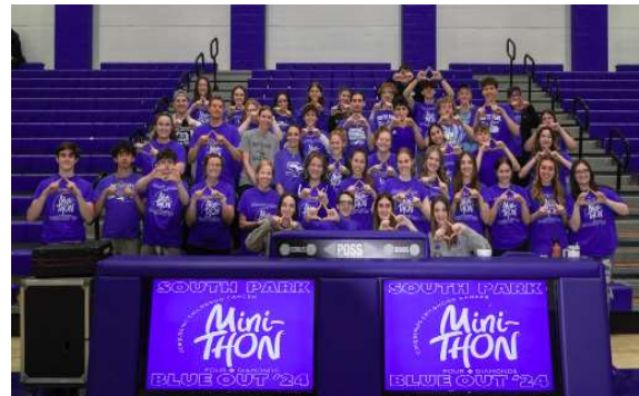
Teachers and students of Mini-THON give the "For the Kids" sign together

Mini-THON is a big part of South Park High School. The club raises money to help cure pediatric cancer. This year, Mini-THON hosted a March Madness game on March 15, 2024. This was the third year they did it and it was definitely impactful.